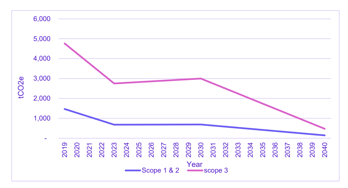
Figure 1: Carbon Reduction Targets Near term (2030) and Net Zero (2040) for Amey OWR Limited